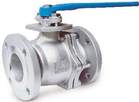
Fig No. MD-52 Full Bore 1/2" ~ 8" DN15 ~ DN200