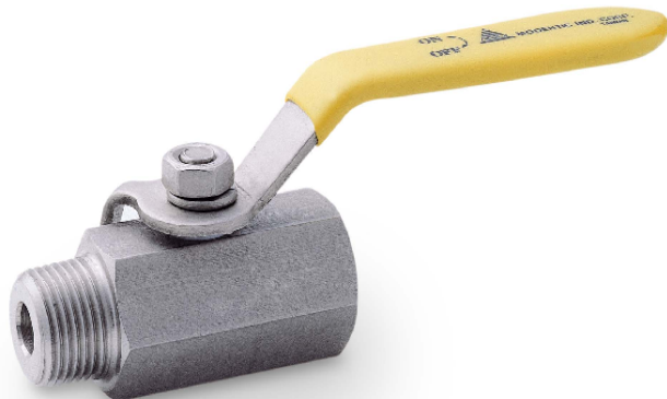
Fig No. V-010 H Reduced Bore 1/4" ~ 1" DN8 ~ 25