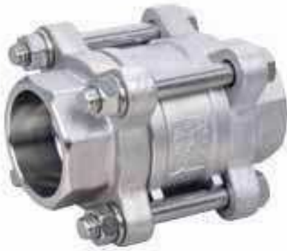
Fig no. WA-002S Full Bore 1/4" ~ 4" DN8 ~ 100